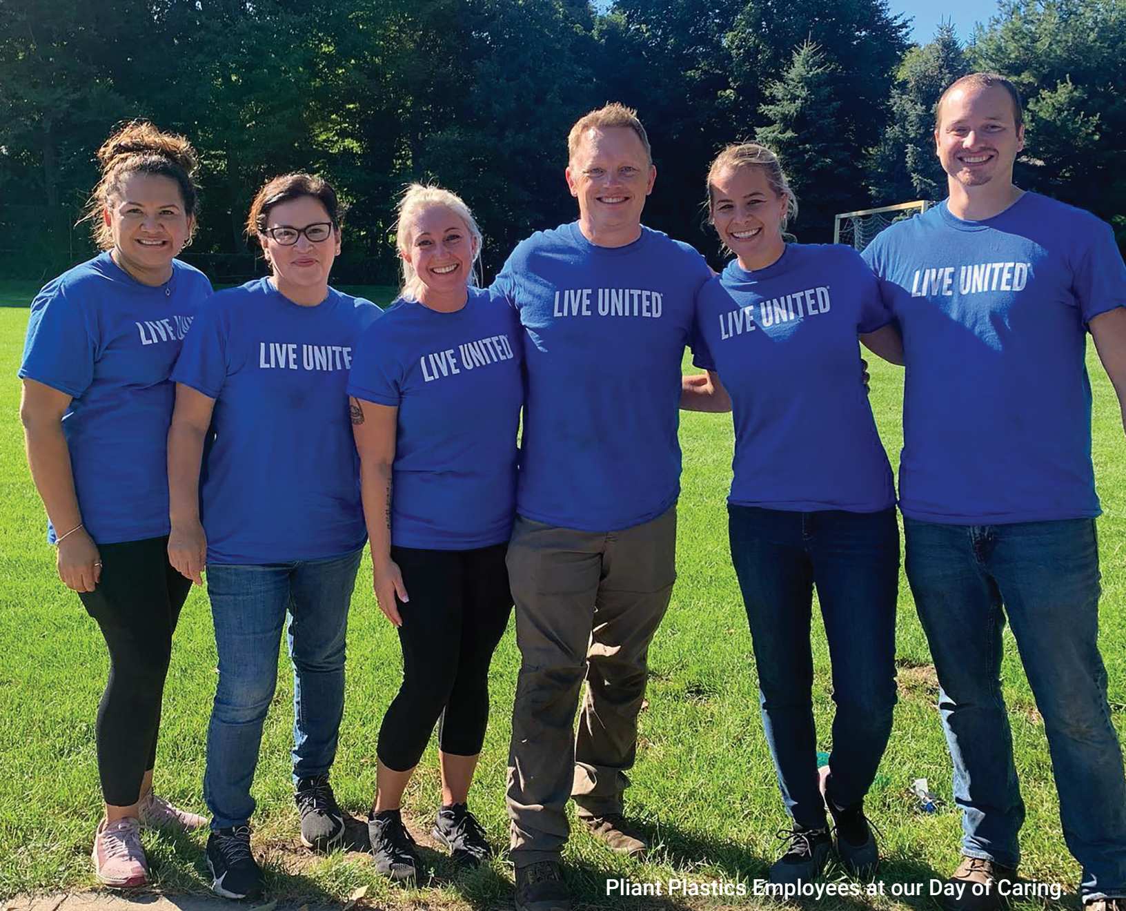
Pliant Plastics Employees at our Day of Caring