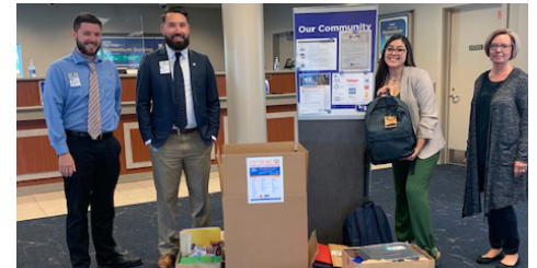
Rake a Difference volunteers (left), Loutit District Library Stuff the Bus donations (middle), Fifth Third Bank Stuff the Bus donations (right).